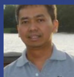
Prof. Wahyu Kuntjoro

Minister of Transportation period 2007-2009 Indonesia