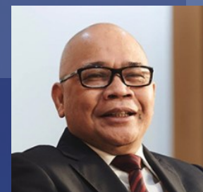
Jusman Safli Djalal

Minister of Transportation period 2007-2009 Indonesia