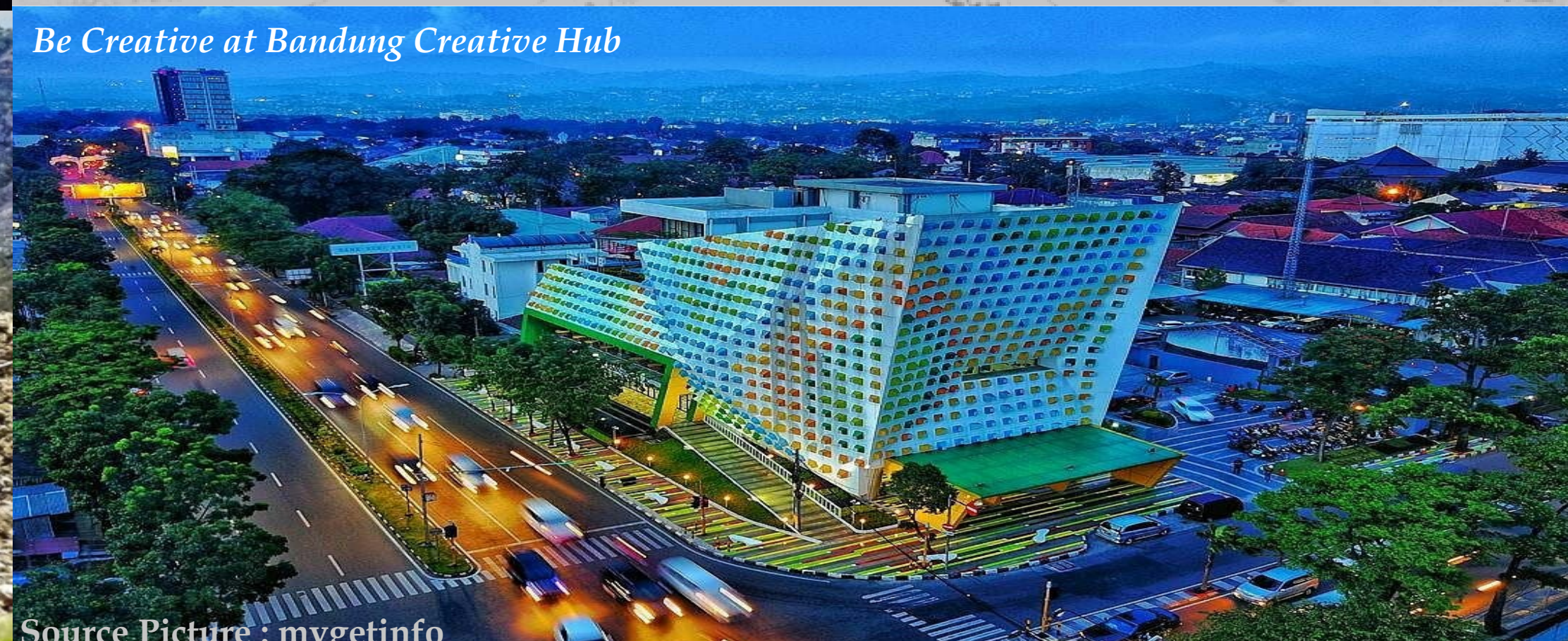
Be Creative at Bandung Creative Hub