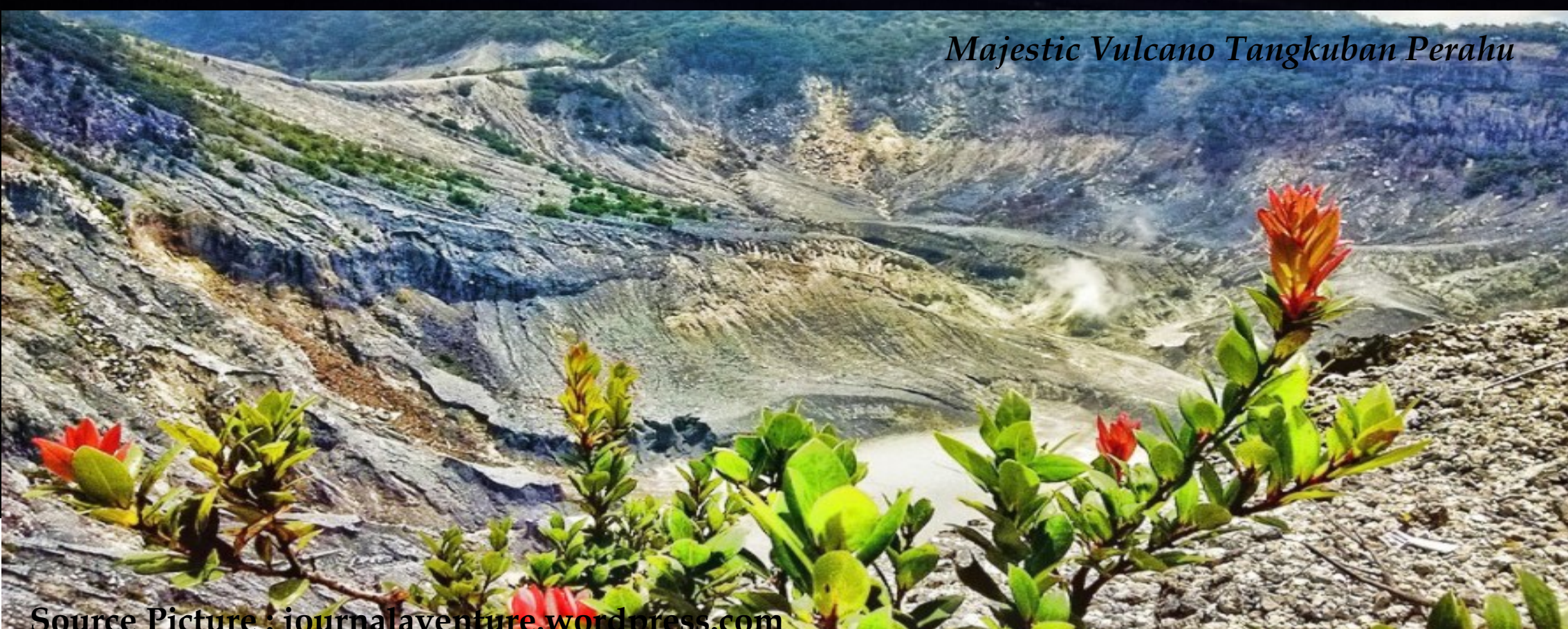
Majestic Vulcano Tangkuban Perahu